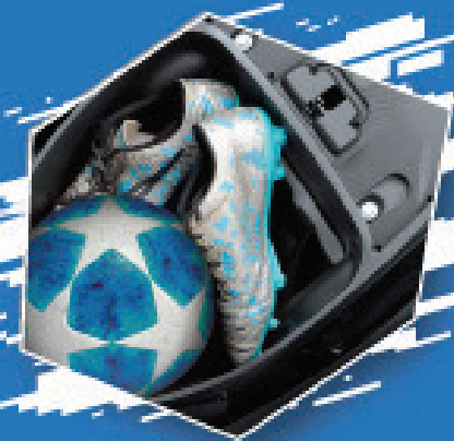
Under Seat Storage

Not just the essentials, keep a whole lot more in the DIO 125's front glove box that is now more spacious than ever.