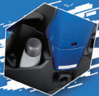
Front Glove Box

Refuel your DIO 125 without ever getting off the seat with the External Fuel Lid.