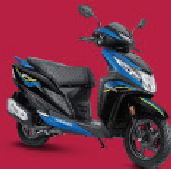
Mat Marvel Blue Metallic