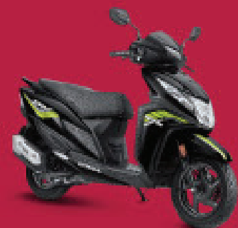
Pearl Nightstar Black