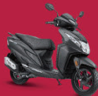
Mat Axis Gray Metallic