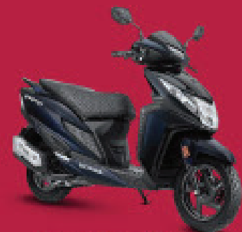
Pearl Siren Blue