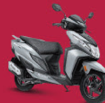
Pearl Deep Ground Gray