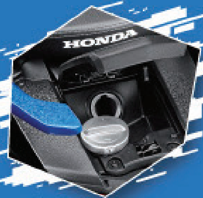
External Fuel Lid

With our extraordinary passing switch, you can pass signals on a low/high beam while riding and own the road the way you were meant to.