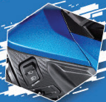
Integrated Pass Switch

With our extraordinary passing switch, you can pass signals on a low/high beam while riding and own the road the way you were meant to.