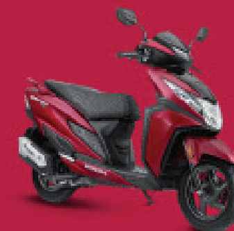
Mat Sangria Red Metallic

The New DIO 125 is available in 2 different variants